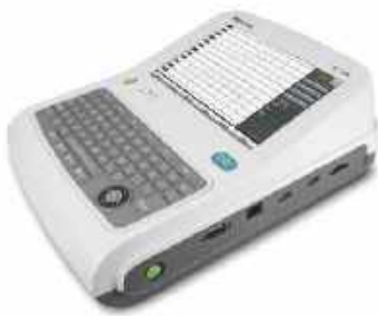
ECG MACHINE 12 CHANNEL