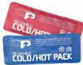
COLD & HOT PACK