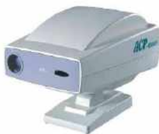
AUTO CHART PROJECTOR