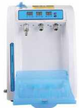
HAND PIECE LUBRICANT