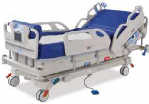
ELECTRIC BED WITH MATTRESS