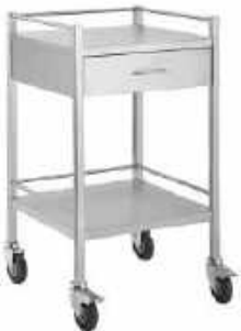
INSTRUMENT TROLLEY WITH ONE DRAWER