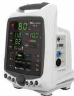
VITAL SIGN MONITOR