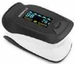
FINGER PULSE OXIMETER