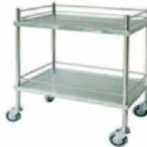
INSTRUMENT TROLLEY WITH TWO SHELF