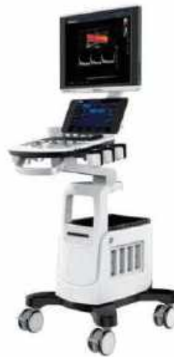
KIRAN SONORAD V10