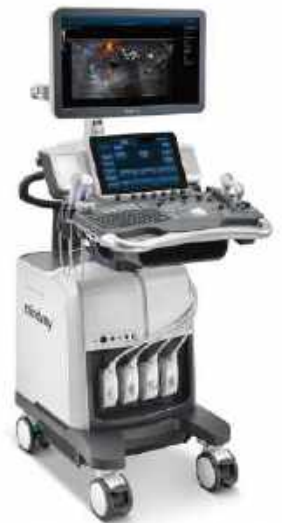
MINDRAY DC 80 X