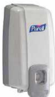
PURELL MANUAL DISPENSER