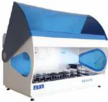
AUTOMATED ELISA PROCESSOR