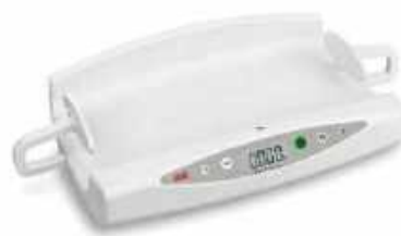
BABY HEIGHT AND WEIGHT SCALE