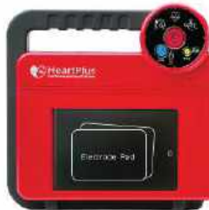
AED MACHINE HEART PLUS