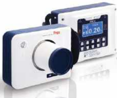
PORTABLE DENTAL X-RAY