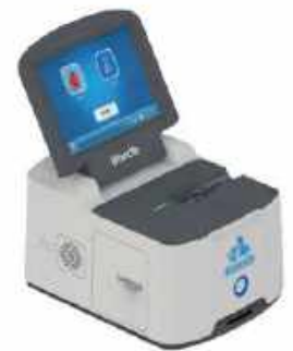
BLOOD GAS ANALYZER