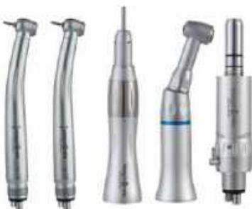
HAND PIECE KIT