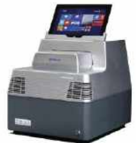
REAL TIME PCR