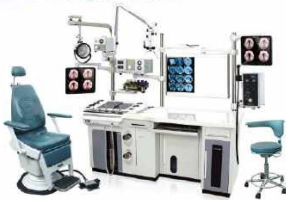
ENT FULL SET