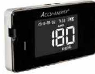
MULTI MONITORING SYSTEM