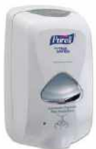
PURELL DISPENSER AUTOMATIC