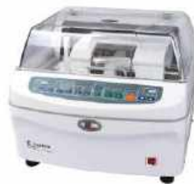
AUTO LENS EDGER