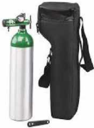
PORTABLE OXYGEN CYLINDER