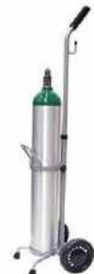
OXYGEN CYLINDER WITH TROLLEY