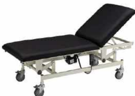
ELECTRIC EXAMINATION COUCH