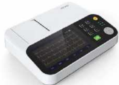
ECG MACHINE 3 CHANNEL