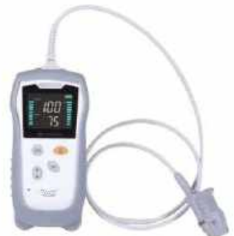
HANDHELD PULSE OXIMETER