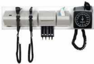
DIAGNOSTIC SET WALL MOUNTED