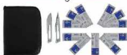
MINOR SURGERY KIT