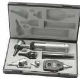
OTOSCOPE DIAGNOSTIC SET