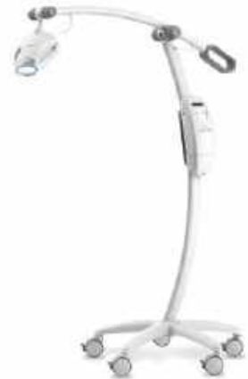
WHITENING MACHINE ZOOM