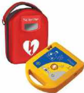
AED MACHINE SEVER ONE