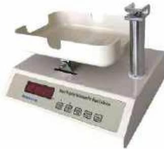
BLOOD COLLECTION MONITOR