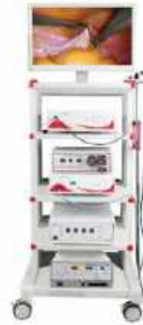
ENT ENDOSCOPY SYSTEM