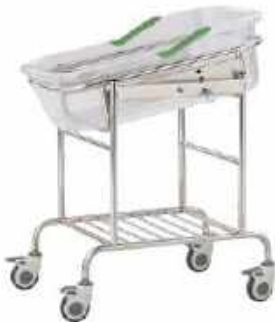
NEW BORN BABY BED