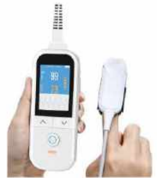
HANDHELD PULSE OXIMETER