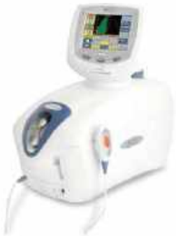
TRITON TRACTION UNIT