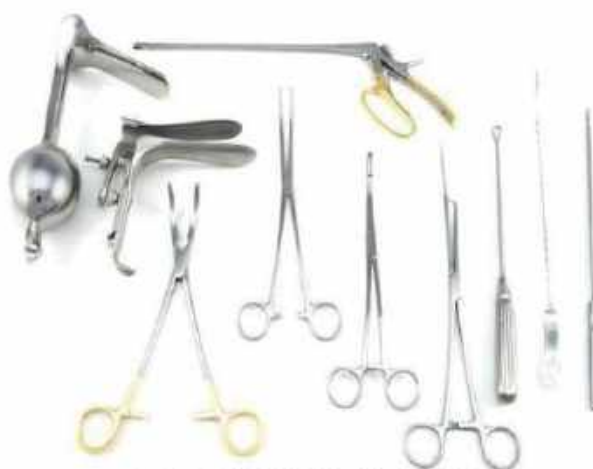
GYNIC INSTRUMENT SET