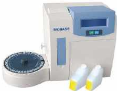
AUTO ELECTROLYTE ANALYZER