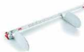
LENGTH MEASURING ROD