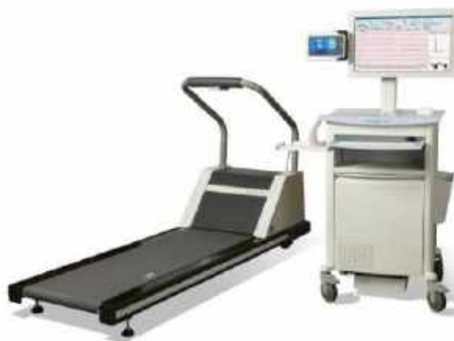
STRESS TEST SYSTEMS