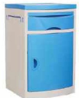
BED SIDE CABINET