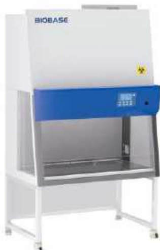
BIOLOGICAL SAFETY CABINET