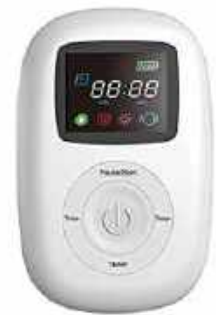
INFRARED CERVICAL VERTEBRA NECK PAIN