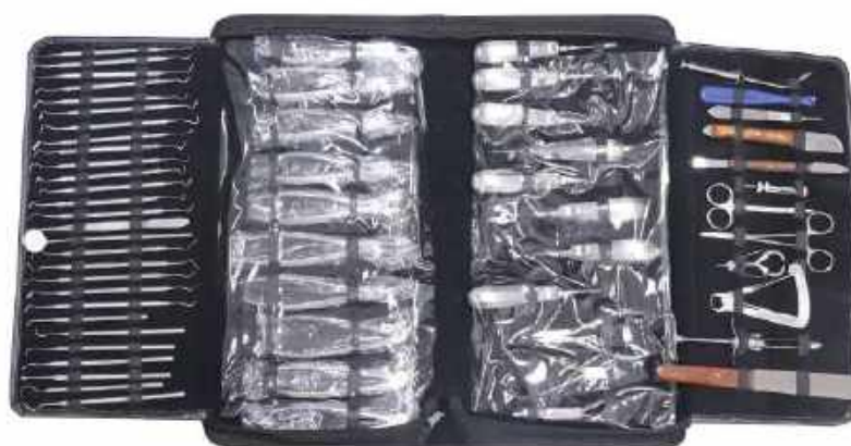
DENTAL INSTRUMENT KIT