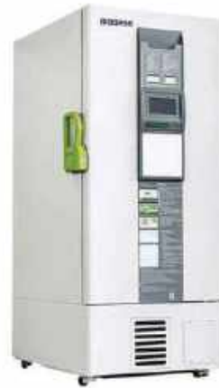
BLOOD BANK FREEZER