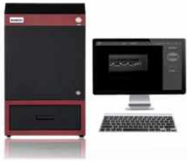
AUTOMATIC GEL IMAGING & ANALYSIS SYSTEM