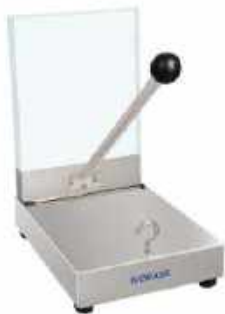
BLOOD PLASMA EXTRACTOR