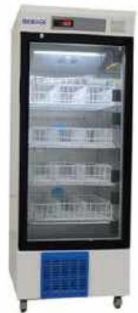
BLOOD BANK REFRIGERATOR