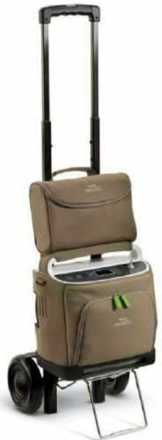
PORTABLE OXYGEN CONCENTRATOR