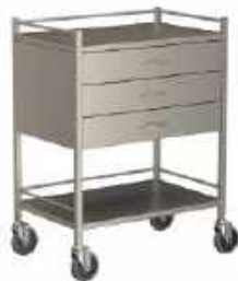
INSTRUMENT TROLLEY WITH THREE DRAWER