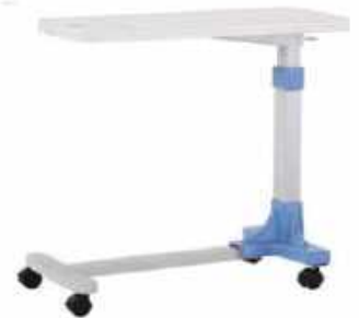
OVER BED TABLE