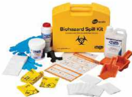
BIOHAZARD SPILL KIT