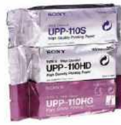
SONY ULTRASOUND PAPER