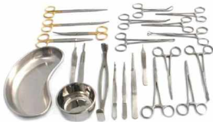
APPENDIX SURGERY SET