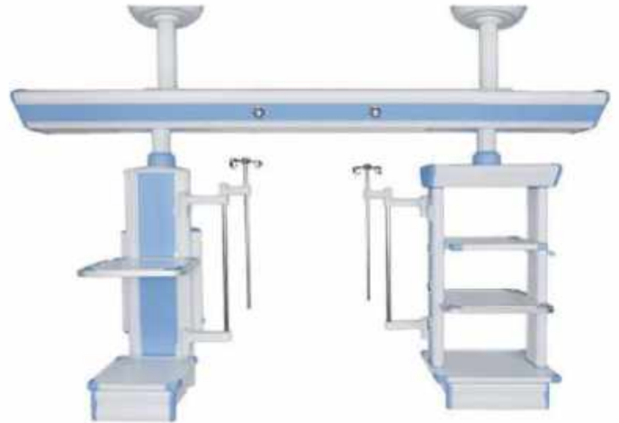
CEILING MOUNTED PANDANT