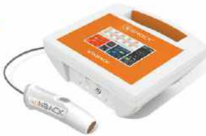
R SHOCK WAVE