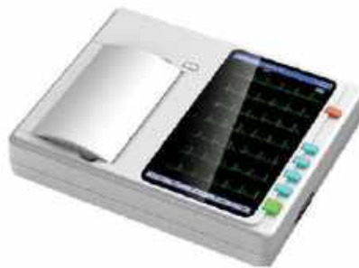
ECG MACHINE 6 CHANNEL